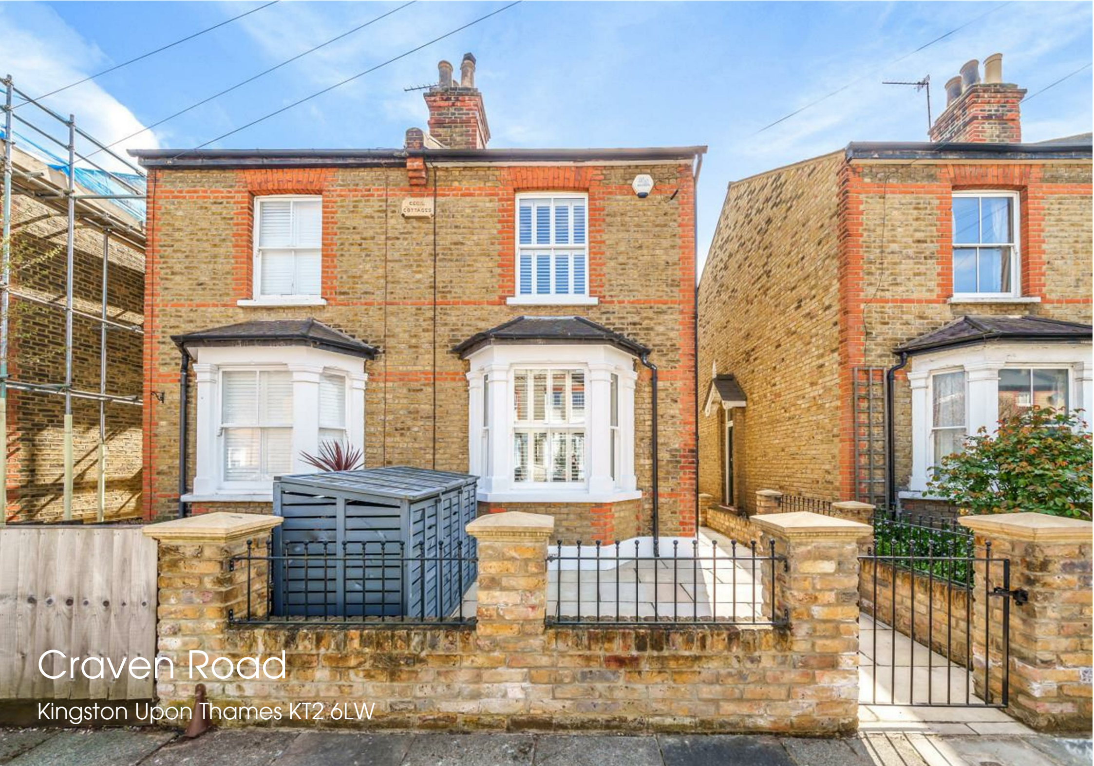
Craven Road Kingston Upon Thames KT2 6LW